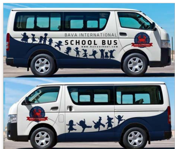
The new Bava School Bus with its proposed design!

8. NORMAL HOME-TIME: Normal school day starts at 7.30am and closes at 2.30pm. Children are to leave school premises by 3pm please. Childcare fees may be charged after that.