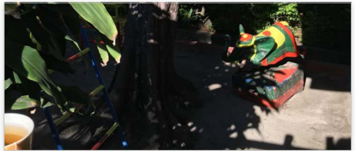
The view from the poolside