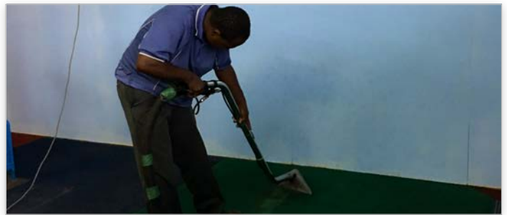
Carpets being steam-cleaned before school starts

8. CANTEEN SERVICES/MEALS: Small and Big lunches available.