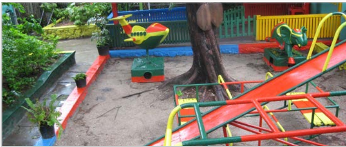
The playground at the front of the school

Parents and guardians are at times asked to offer any suggestions to improve the school.