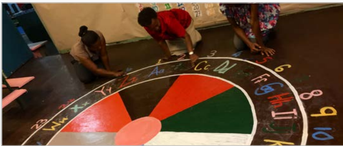
The Circle Time Area for the Play/Preschool children

7. LIBRARY FOLDERS/BAGS: Will be issued for those who have paid. These are available from the office.