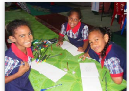
Art is always a popular subject!