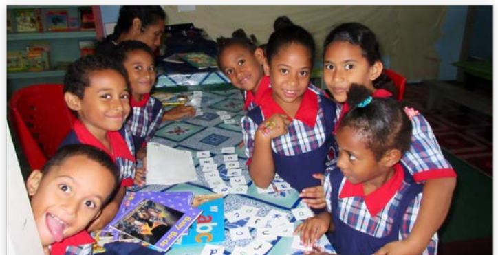
Look at all these smiling faces happy to be back for Term Two!

3. PORT MORESBY RACQUET CLUB: MONTHLY PURPOSE VISIT TO USE PREMISES - Arrangements are still in the progress and will confirm when to inform in good time.