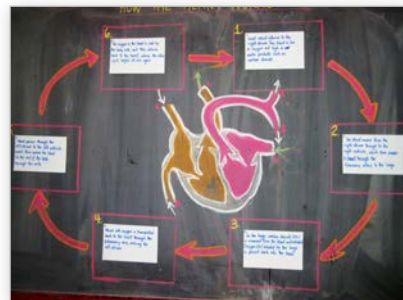
A heart diagram in the Grades class