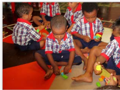
Little ones building with blocks