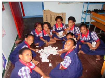
Grades class girls working on language