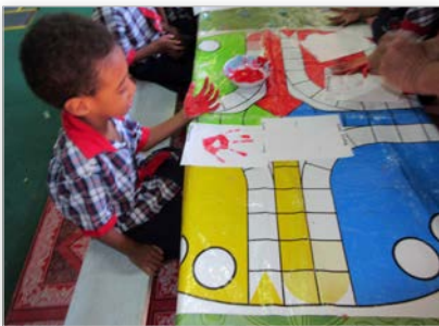
Hand painting crafts with the little ones