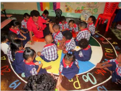
Playschool during class time

Let us now visit your children to hear and learn from their teachers about them.