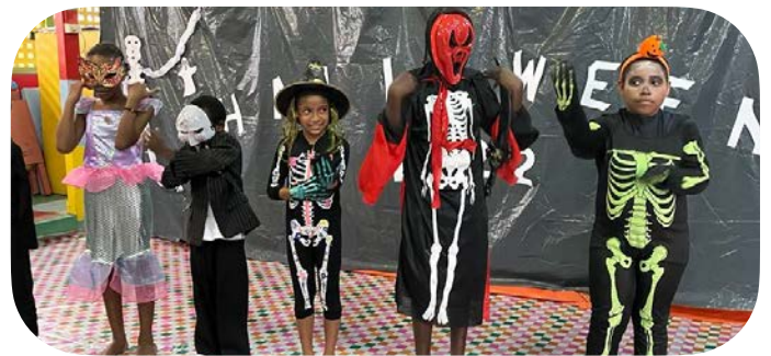
Being spooky can also be fun!