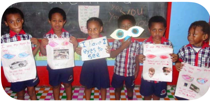
"I have 2 eyes to see" - learning about the human body

Halloween program was a success we celebrated with a costume parade, storytelling, video, and trick-or-treat time. Thank you to all our parents who assisted their children with their costumes and packets of lollies for their baskets.