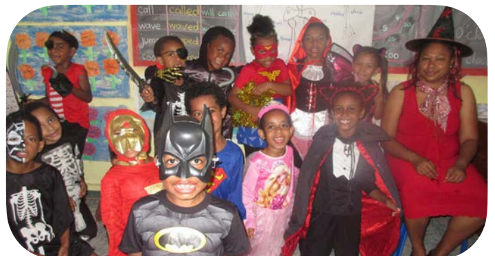
All the children loved dressing up for Halloween! BOO!

9. SWIMMING LESSONS: Every Thursday, please don't forget to pack swimmers/towel for your child to participate.