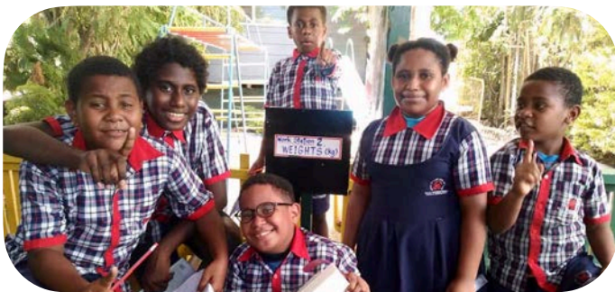
Grades class outside measuring weights for their practical lesson

Let us be mindful that they are all looking forward to their end-of-year concert celebrations and preparations.