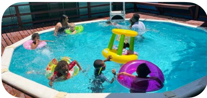
Don't forget to pack swimmers and a towel for your child on Thursdays!