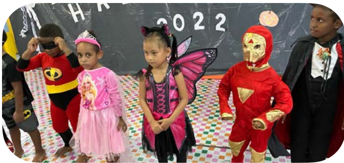
More wonderful costumes on display at Halloween