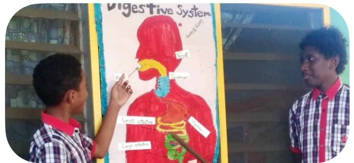
Gairo and Karo discussing the Digestive System for Science