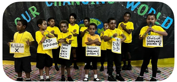
A presentation from the Term 3 connect about mathematics