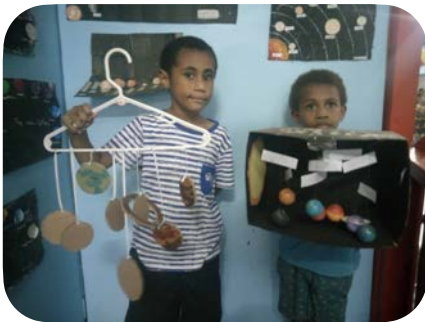
Amazing solar system models on show