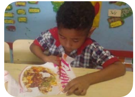
Book week collage hunting