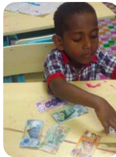
Learning the different values of money