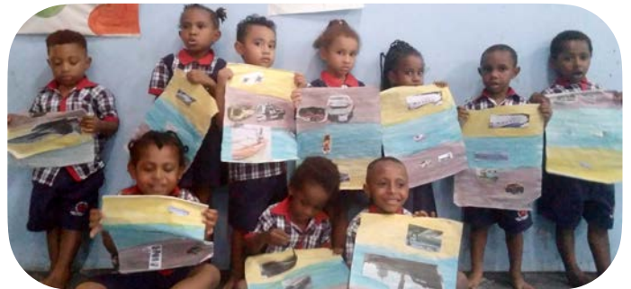
Here they are showing their collages about transport systems