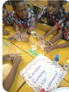
Science: Rainbow running water experiment