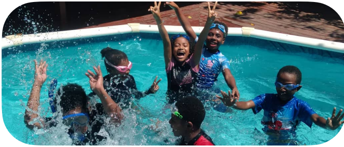
Swimming lessons are a weekly favourite for the students