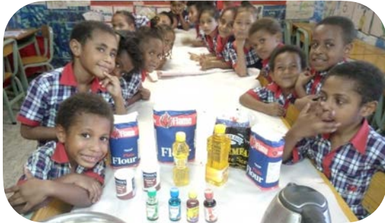
Making play dough as a whole class for arts and crafts