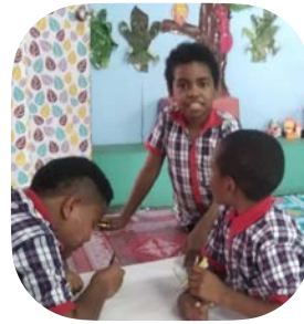
Cheeky smiles all around the Grades classroom while focusing on projects