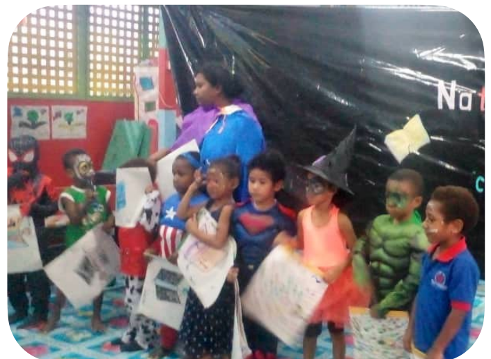
Some wonderful costumes were worn by children for National Book Week

So that you are informed in ample time in order to avoid any future confusion & disappointments. Thank you for your understanding and cooperation.