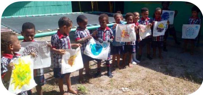
Playschool showing their artwork on the solar system