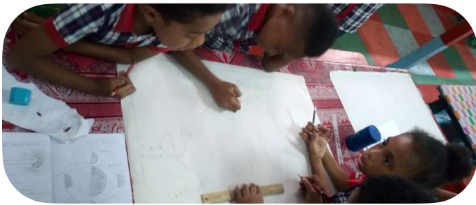
Sketching up the 4 phases of the moon for science class