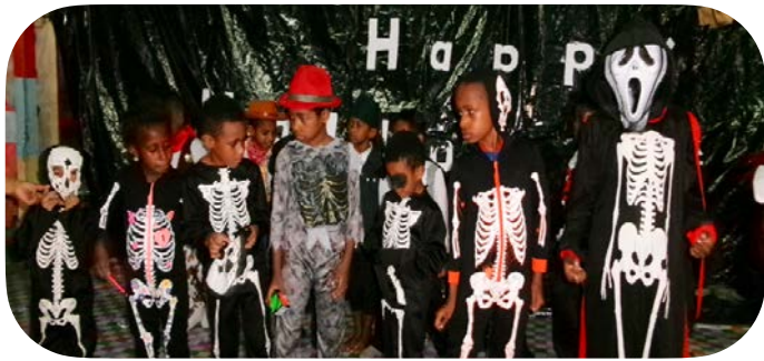
The spooky skeleton gang on Halloween... BOO!

5. SCHOOL LEAVER FORMS: Kindly return forms by the end of next week and to secure your child's space, the registration fee of K300 must be paid. Those leaving must fill out this same form and return it by next week to prepare the necessary paperwork. Help us to help you.