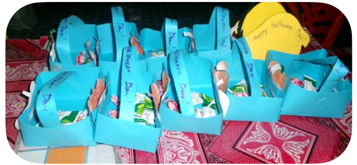
Some of the halloween trick or treat baskets that students made

6. TRANSPORT POLICY: All students using this service must be officially registered by filling in the form to protect us all. No Form Filled means students will be denied access. Transport is also to be paid in advance like the School Fees.