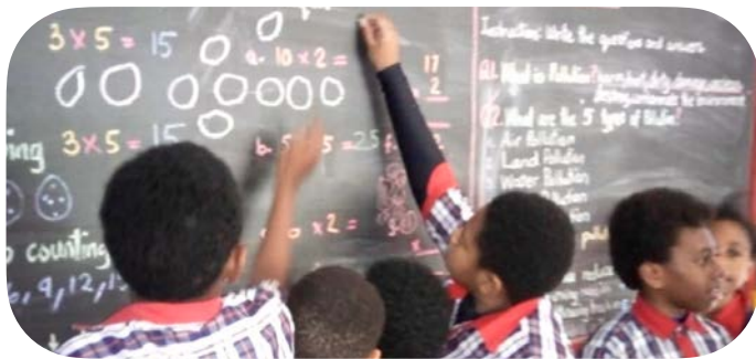
Grades class in a maths lesson involving operations

English: Reading narratives and learning how to write book reviews.