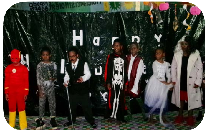
Wonderful and weird costumes were enjoyed on Halloween!

2. OUTSTANDING SCHOOL FEES: MUST BE COMPLETED IN FULL BY FRIDAY 24 NOVEMBER! NO REPORTS/CERTIFICATES/AWARDS WILL BE PROVIDED FOR THOSE STUDENTS STILL OWING. *CHILDREN WILL NOT BE ALLOWED BACK AT SCHOOL. THANK YOU.