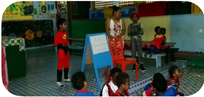
Students dressed up as "book characters" during Halloween