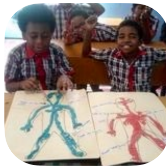
Science lessons: Painting the body & a maths lesson on weighing volumes